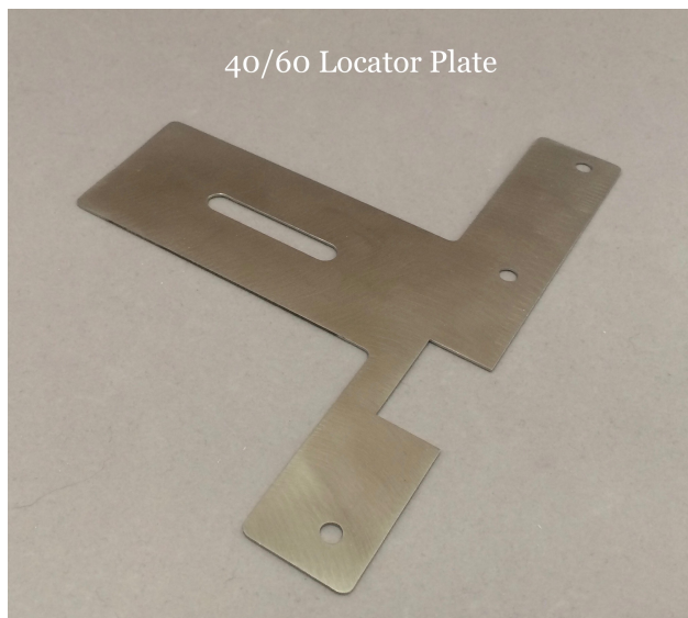
40/60 Locator Plate